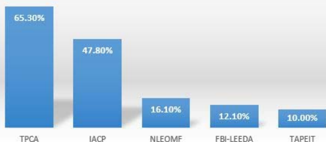
Fig. 2. Membership in Top 5 Professional Organizations

The final holdover module from the Wave I data collection was the Networks and Communications module. This module was designed to assess which organizations police chiefs belong to, as well as who they contact in law enforcement. The organization with the greatest membership was the Texas Police Chiefs Association (TPCA; 65.3%), followed by the International Association of Chiefs of Police (IACP; 47.8%), the National Law Enforcement Officers' Memorial fund (NLEOMF; 16.1%), FBI-LEEDA (12.1%), and TAPEIT (10.0%; see Figure 2).